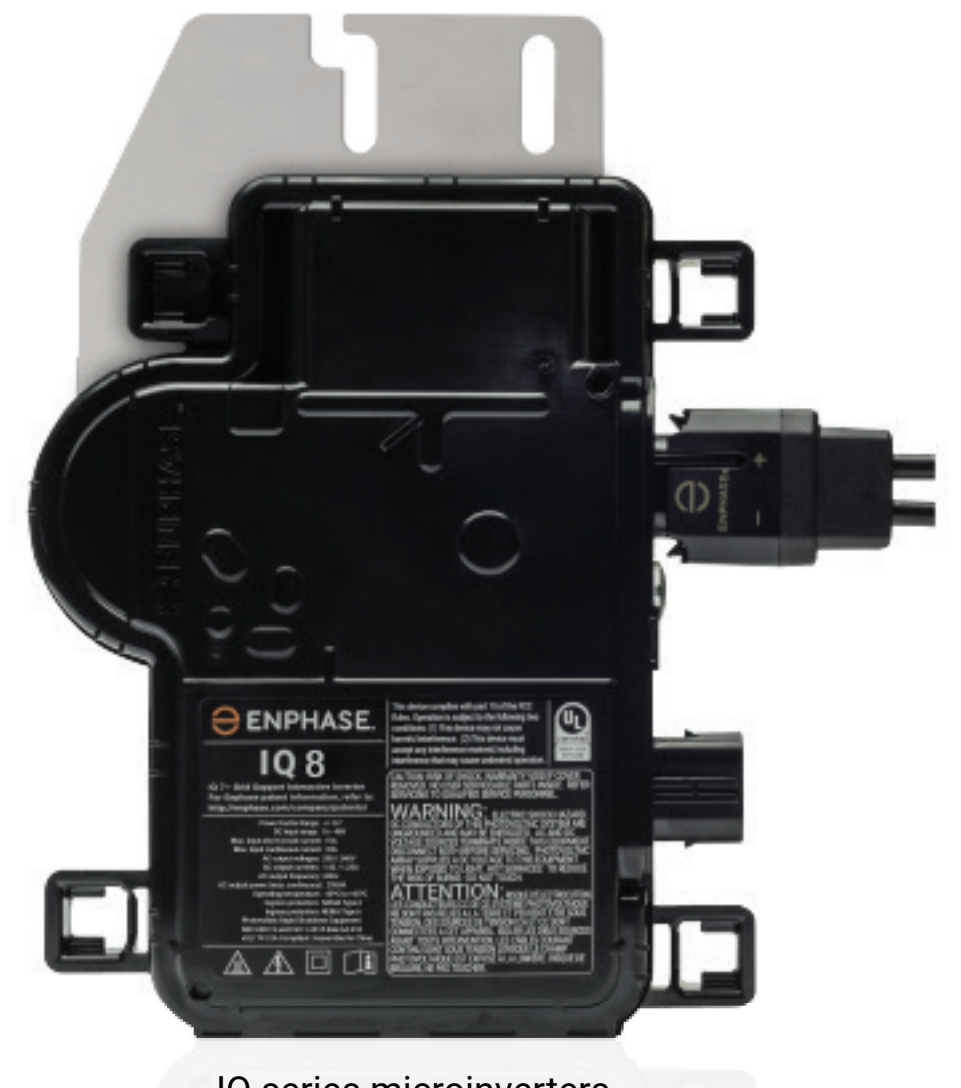
IQ series microinverters

The heart of our distributed architecture that comes with a 25 year limited warranty.