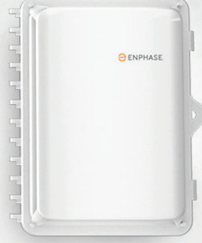
IQ™ combiner series

This loT device allows for communication with your installer and Enphase to ensure servicing and, enabling software updates as they are made available.